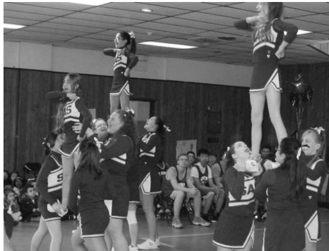
St. Andrew’s Champion Cheerleaders